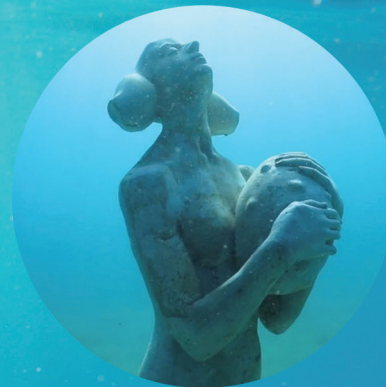
THE SEED AND THE SEA by Davide Galbiati