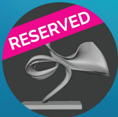
BLOOM BABY BLOOM by Brit Deslonde